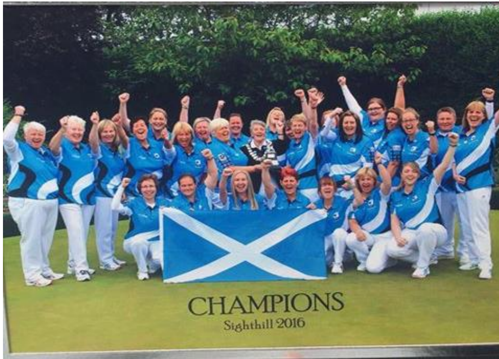
CHAMPIONS! SCOTLAND WIN THE 2016 BIWBC INTERNATIONAL SERIES AT SIGHTHILL IN EDINBURGH